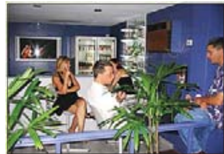
■ Jupiters Casino

Located just 5km to the CBD, Closest Motel to the Murray Sporting fields, Two blocks to Townsville Golf Club, A few kilometres to both the General and Mater Hospitals Approx. 7 km to Townsville Airport Make Spanish Lace Motor Inn THE place to stay.